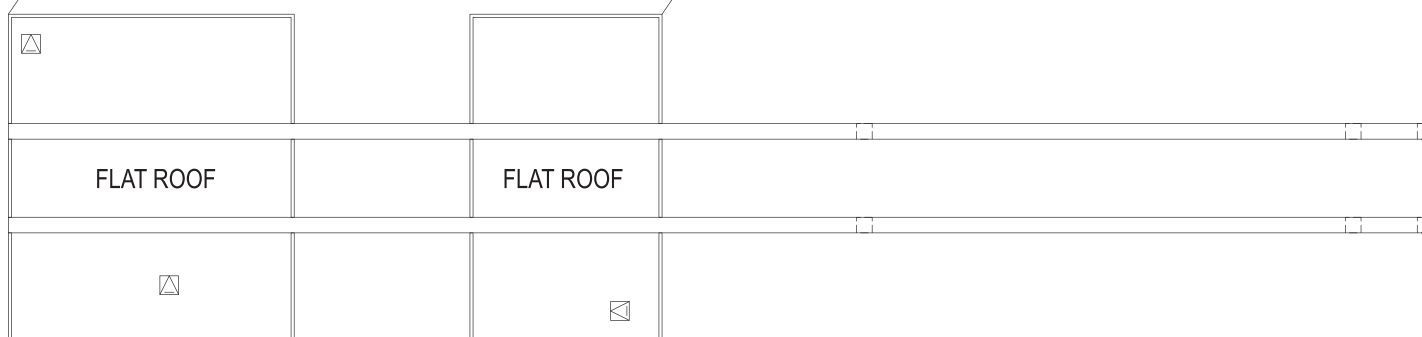
TOP ROOF PLAN