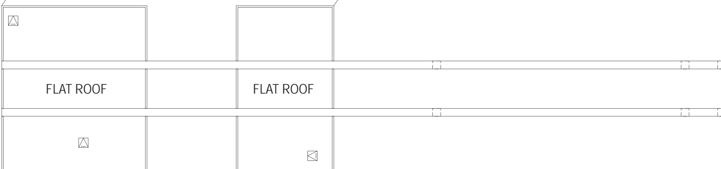
TOP ROOF PLAN