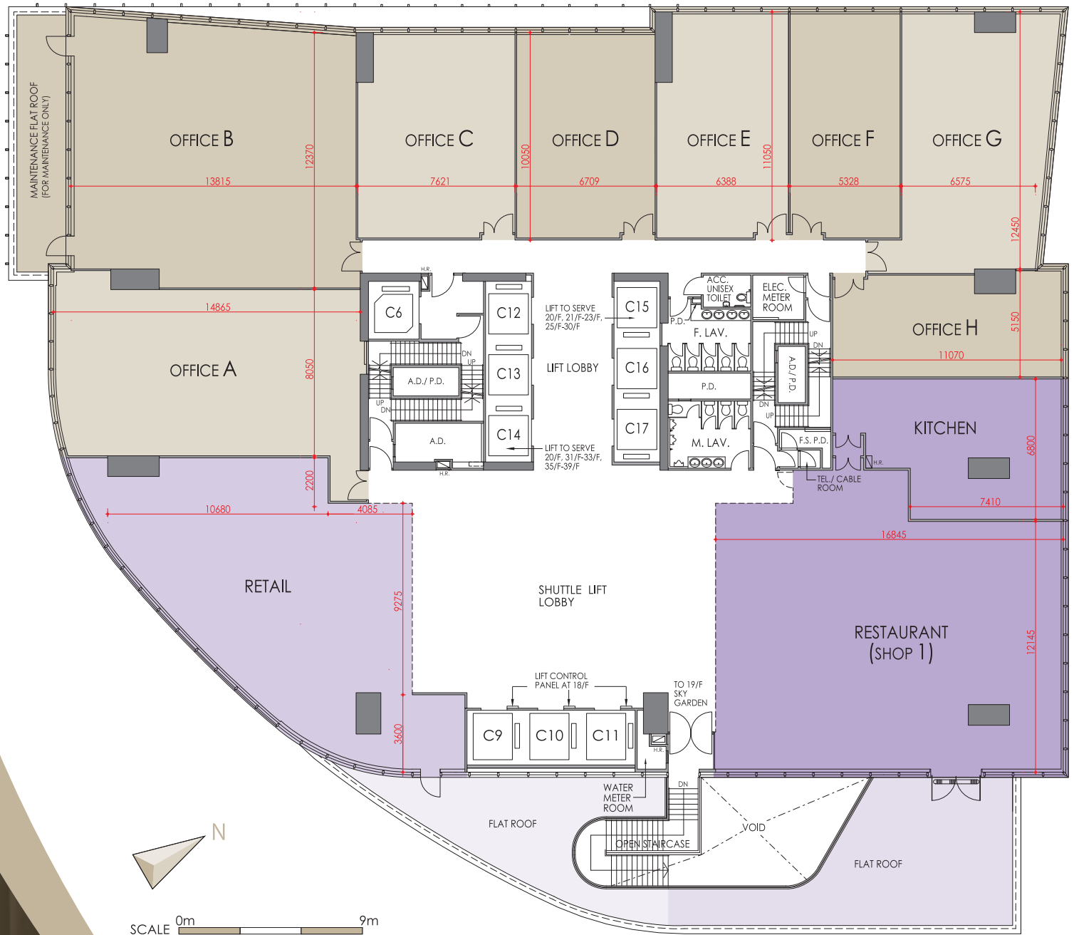
20 th Floor Area Schedule