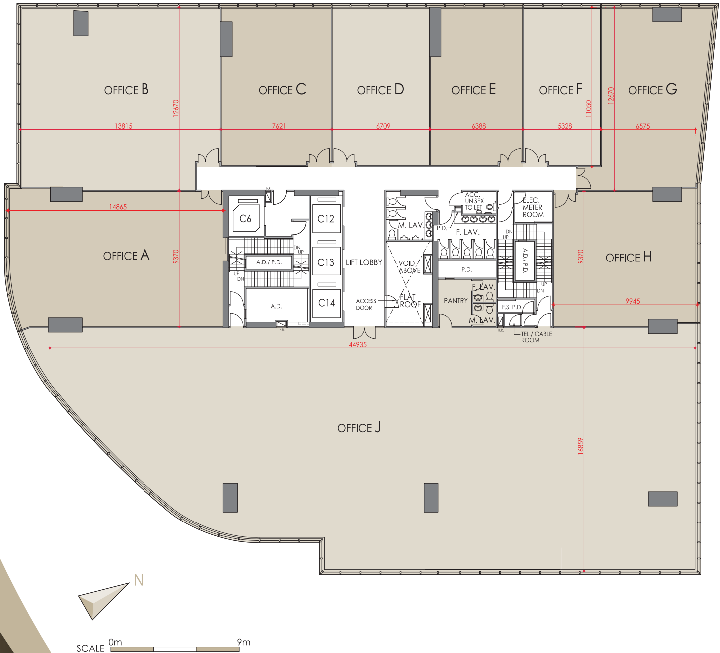
33 rd Floor Area Schedule