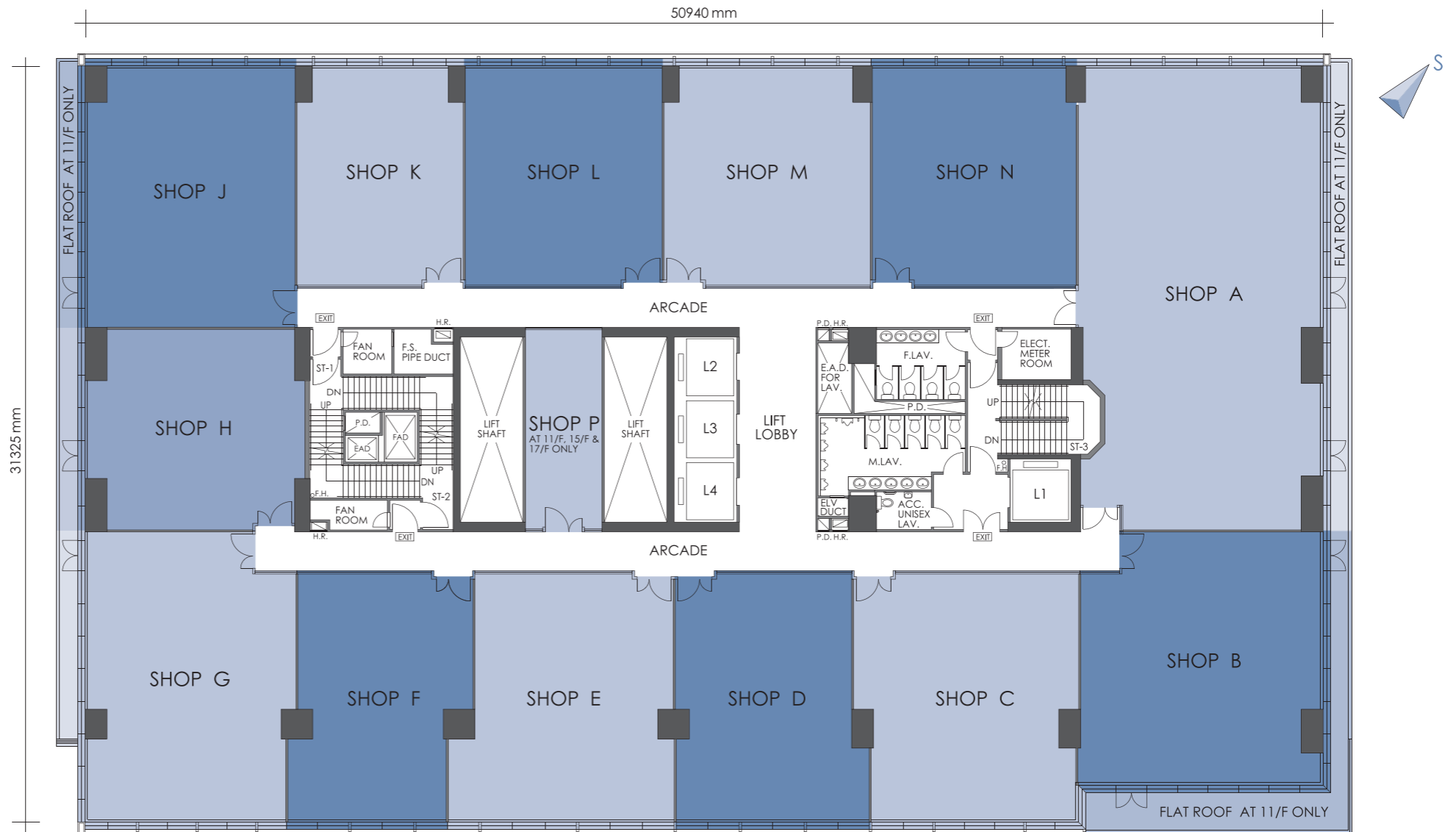
11 th , 15 th & 17 th FLOOR AREA SCHEDULE