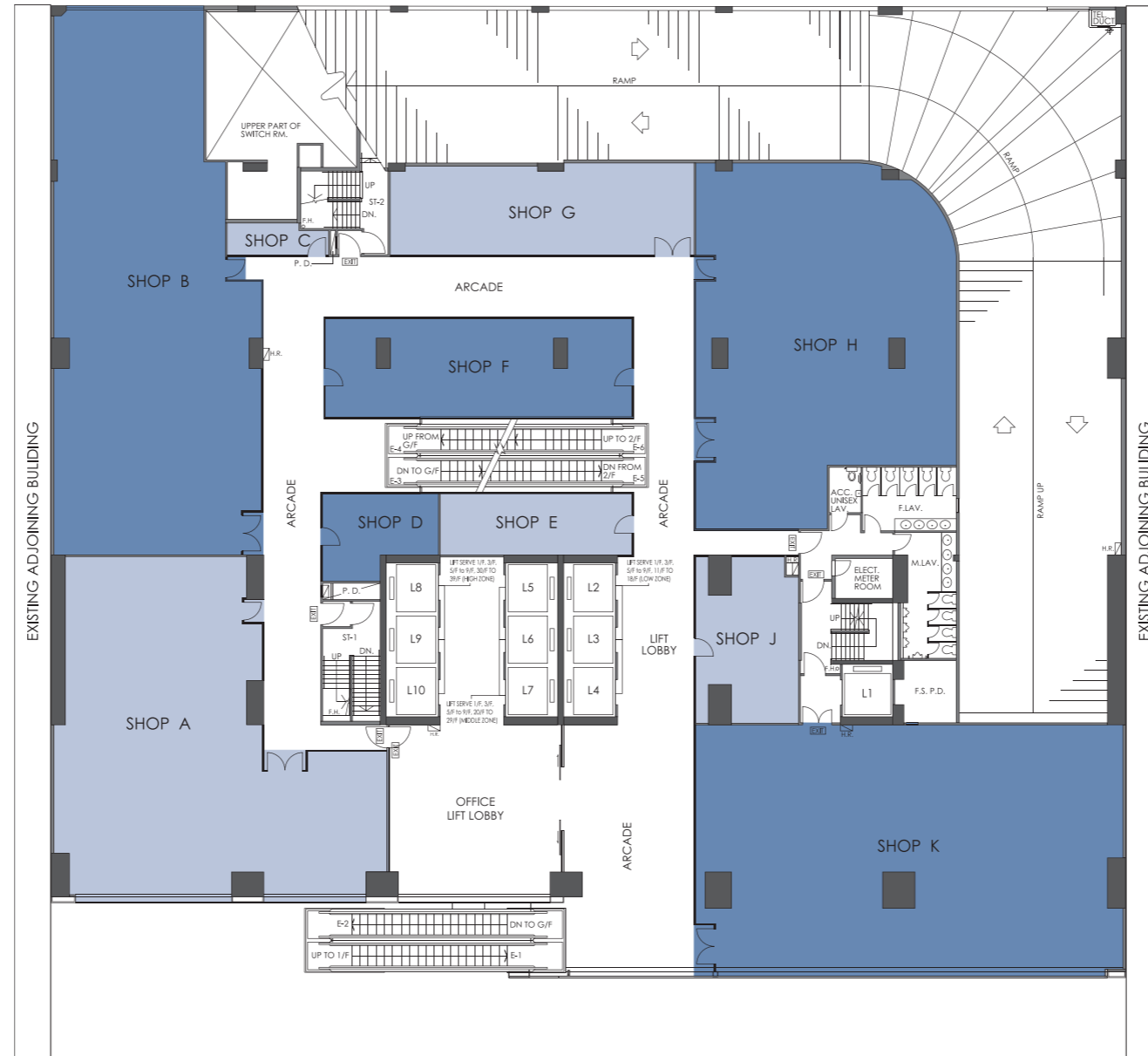
UPPER PART OF G/F PLAN