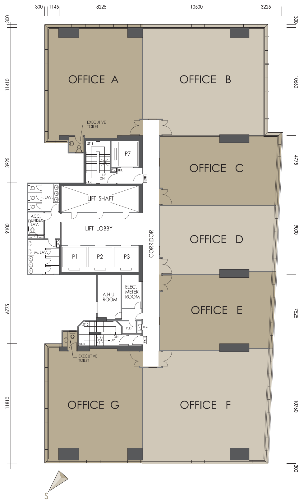
16/F PART PLAN